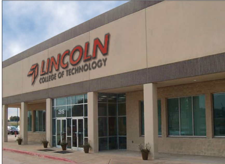
Grand Prairie, TX Campus