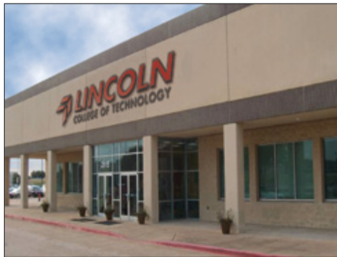
Grand Prairie, TX Campus

At the time of publication, every effort was made to assure that this catalog contains accurate information. Please refer to the catalog addendum for any changes or revisions that have occurred since the catalog was published.